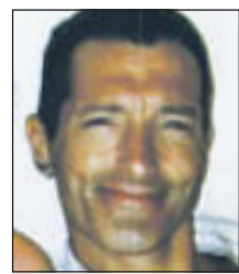
Shot... Alistair Bell

*VAT free offer on Swift range: Swift 1.2 SZ2 3dr available at £8,999, including a customer saving of £1,800 to Swift 1.2 SZ4 5dr 4x4 available at £13,116 including customer saving of £2,623 equivalent to VAT amount of previous on the road price of £10,799 (SZ2 3dr) and £15,739 (SZ4 5dr 4x4). VAT Free offer excludes Swift Sport and Swift Sport SZ-R. VAT equivalent reduction is not available on vehicle options or accessories. For full details contact your local participating Suzuki Dealer. Offer subject to availability for vehicles privately registered between 1st January 2014 and 31st March 2014 from participating Authorised Suzuki Dealers only. Offer cannot be used in conjunction with any other offers. All prices and specifications correct at time of going to print. Specifications and prices refer to the 2013 facelift model.